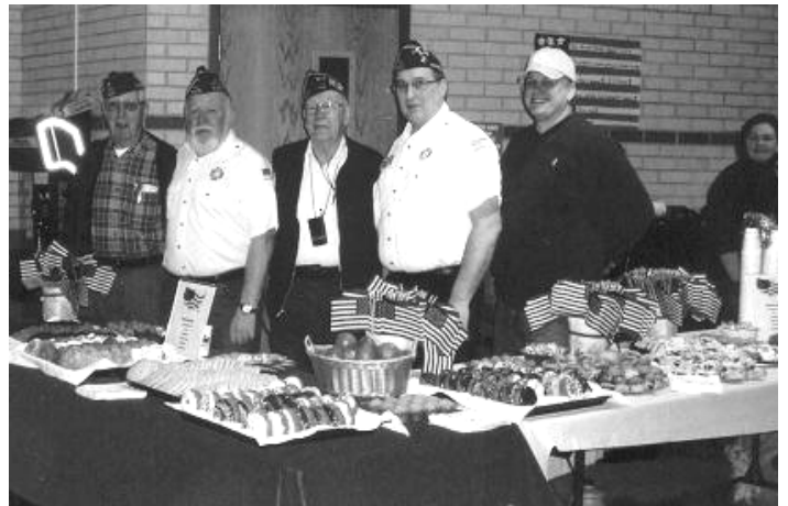
Post 9433 & Auxillary members hosted a "Send Off" party for Red Bull soldiers and their families prior to their deployment to Fort Lewis.